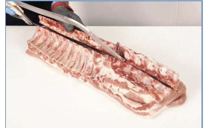
3 ... including flat bones of the lumbar section.