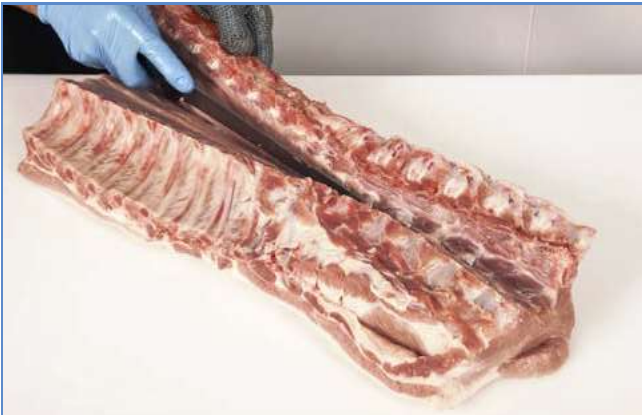
4 Remove vertebrae's and feather bones leaving a minimum of ...