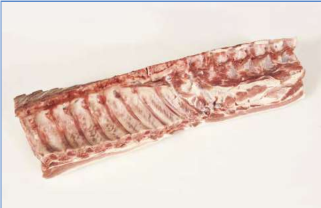
1 Loin of Pork – bone-in, rindless, excluding fillet.