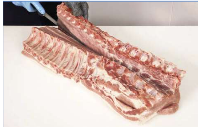
5 ... 20 mm of meat on the bones.