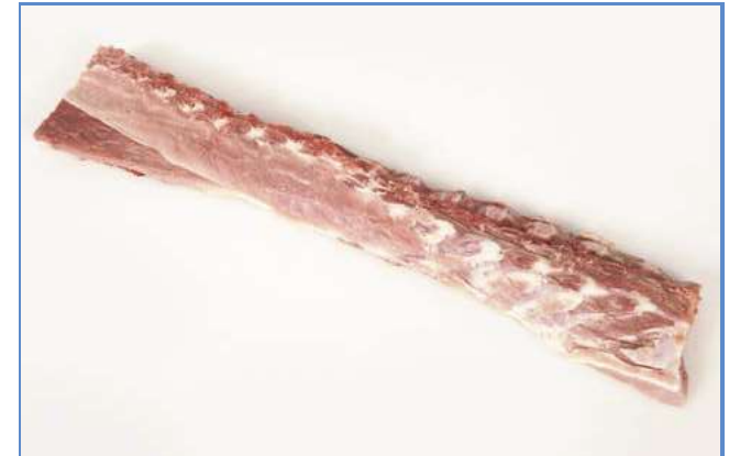
6 London Rib Rack – loin.