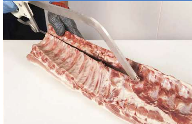
2 The ribs are sawn through at a point where they join the vertebrae ...